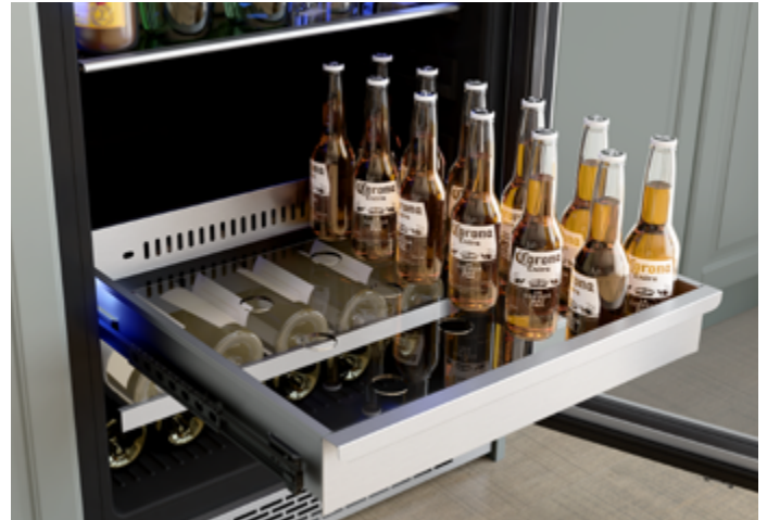
Full-Extension Stainless Steel Rollout Bin with Transparent-Gray Glass