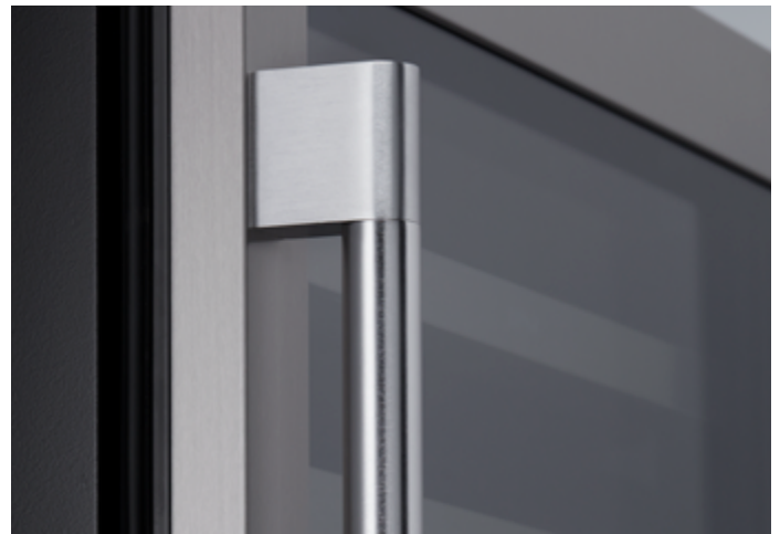
Optional Pro Handle