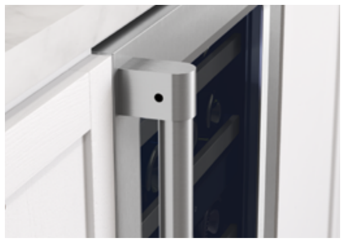
Door Lock in Pro-Style Handle