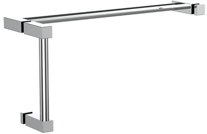
Offset Door Handle Shown with no Rosette