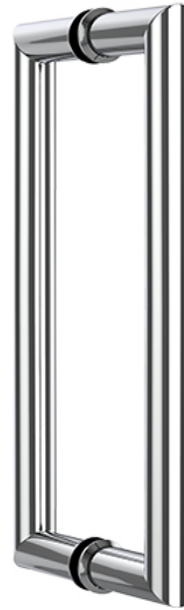
Double Door Handle shown with a small Rosette