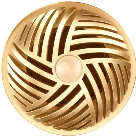
Shown in "SSB-SCR01"