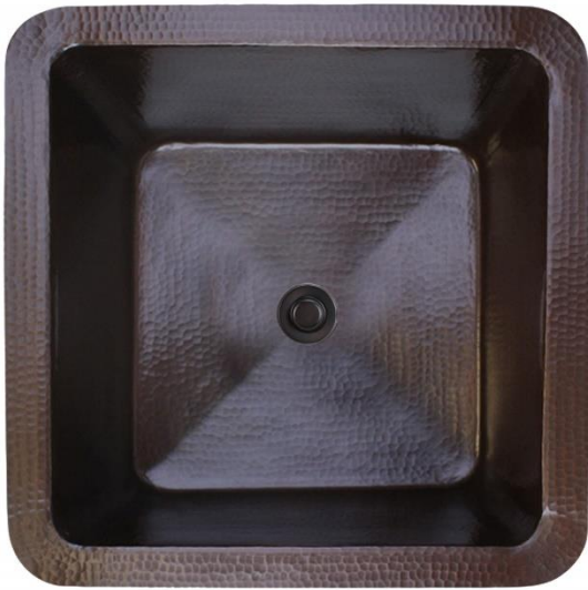
Shown in DB