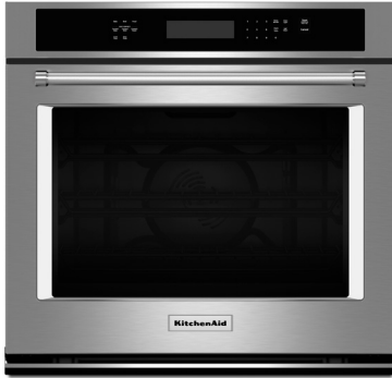
Stainless Steel KOSE507ESS