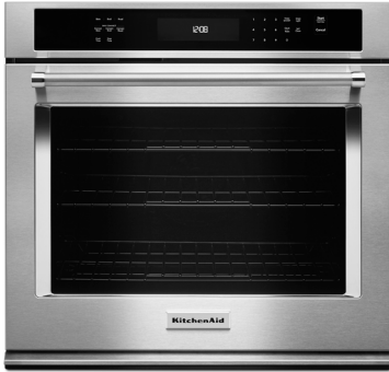
Stainless Steel KOSE500ESS