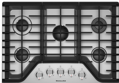
Stainless Steel KCGS350ESS