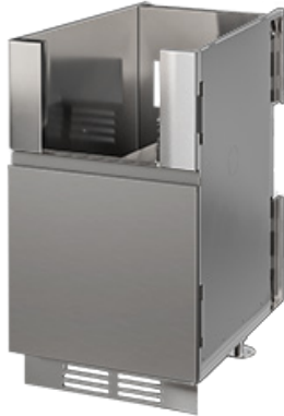
Fillers are adapted to the dimension of your burner

24" Grill Base Cabinet 1 door right hinges