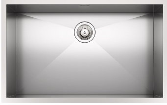
Armored Sink 32" x 20" – U/M - 1237 660