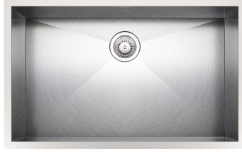
Armored Sink Vintage finish 32" x 20" – U/M - 1237 680